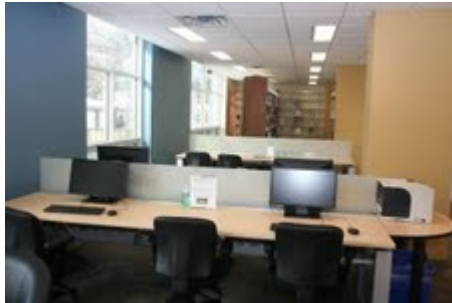
View into stacks & the print collection...

The Sister St. Odilon Library at the Misericordia Health Centre is now open in its new location.