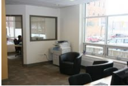
Hospital librarian's office