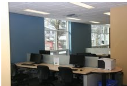
OPAC Area across from hospital librarian's office